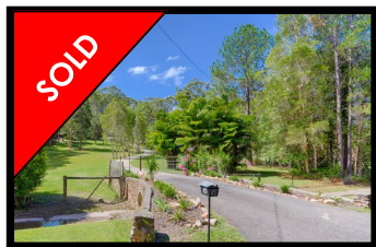
Redwood Road, Doonan