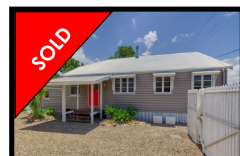
Station Street, Pomona