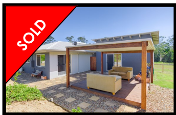
Forest Acres Drive, Lake Mac

With many Sales, we are looking for New Listings