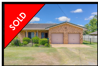
Opal Street, Cooroy