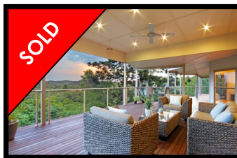
Jocelyn Drive, Eumundi