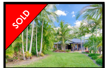
Forest Acres Drive, Lake Mac