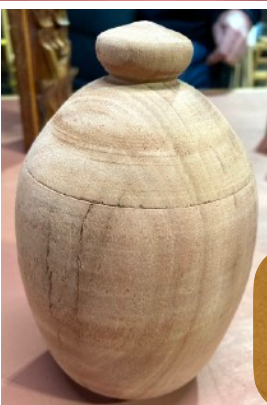
Mike's unfinished first turning, a lidded pot