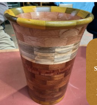
Don Mc's segmented waste paper bin