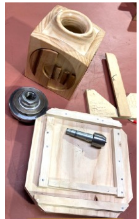
DonV's square turned box & tools for making it